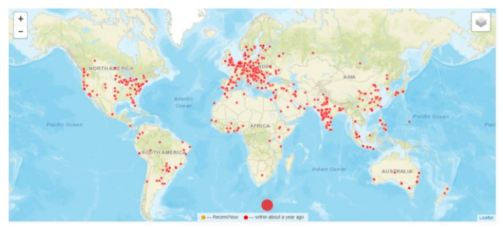
Visitor Map 2019 for ISTRO.org.

In ISTRO, we look forward to busy year with board, working group and branch meetings as well as a regional Central European conference (see details below). The current travel restrictions will, hopefully, be lifted long before these events allowing any interested to attend.