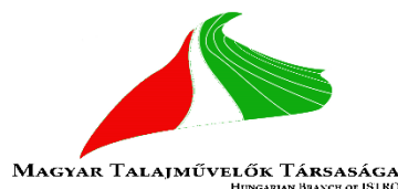
HUISTRO Hungarian branch of ISTRO