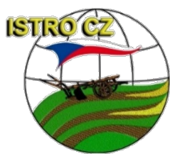
ISTRO CZ Czech branch of ISTRO