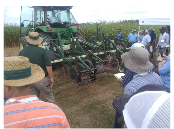
Demonstrating crimping system for cover crop management at the US Southern Cover Crop Council meeting.

of the nternational Soil Tillage Research Organisatior